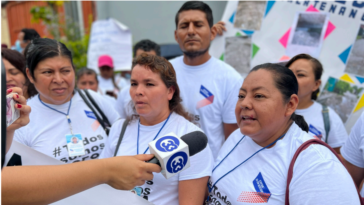
Public demonstration at Salvadoran Ministry of Municipal Works to press government to release funding designated for community development.

it difficult to understand the relationship between promises and actual investments.