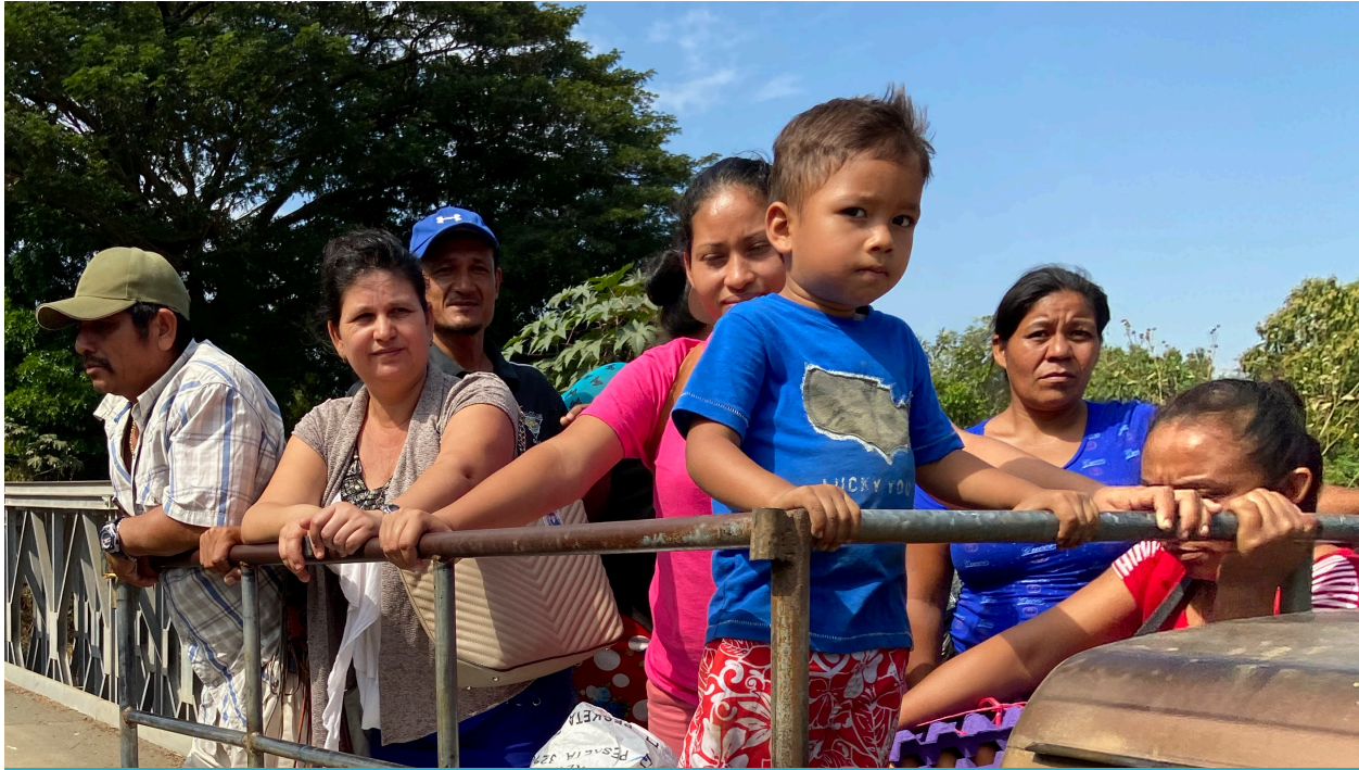
Family safely crossing the Rio Roldan on a bridge built as a result of a grassroots organizing campaign by Comunidades de Fe Organizadas en Acción (COFOA).