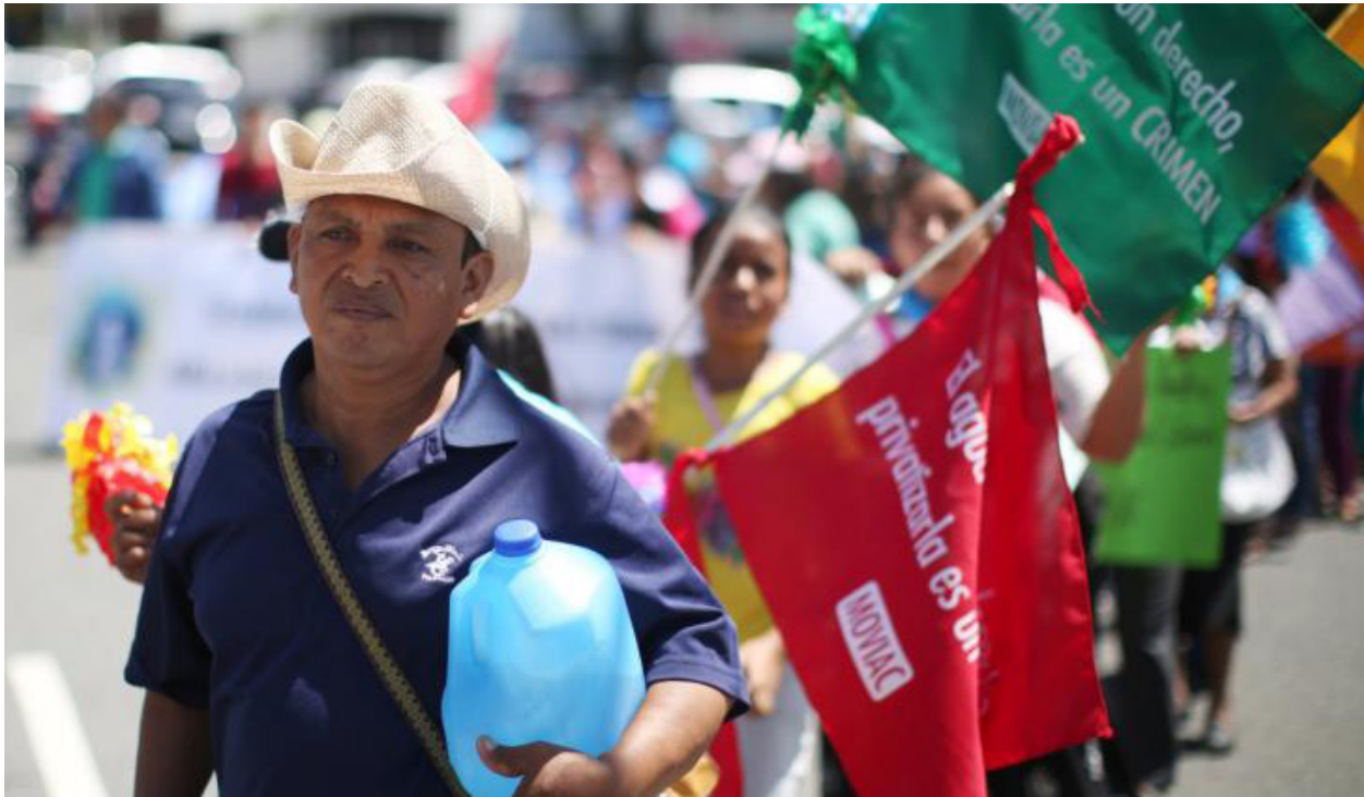
March against water privatization in El Salvador.