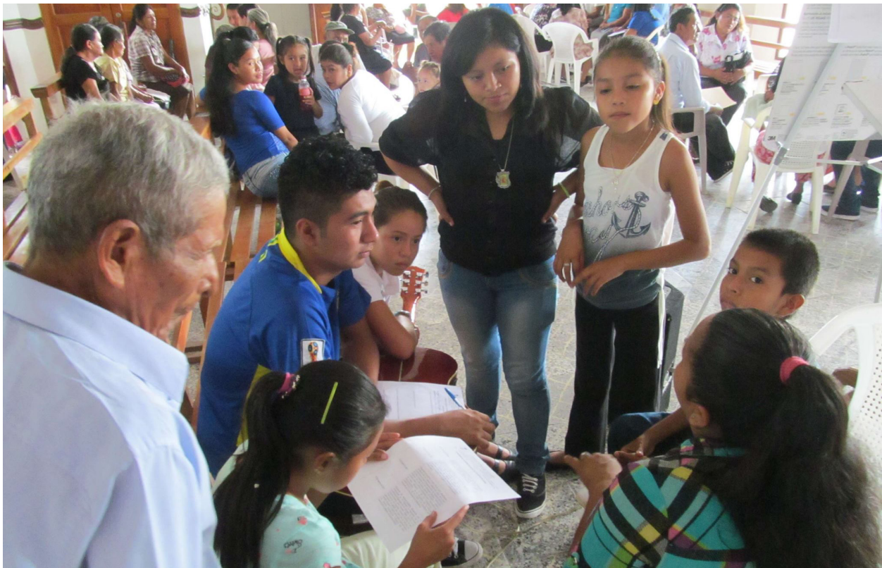
Grassroots community meeting in Honduras.

One area where the United States can quickly and effectively address irregular migration from the region is by issuing more temporary work visas, combined with stronger labor protections. The administration has made progress in providing temporary visas to workers from Central America, but these remain insufficient in scale and relative to the demands of the U.S. labor market. The number of workers from Northern Central America receiving temporary visas increased from 11,000 in 2021 to just under 20,000 in 2022. Based on reviewing research by the Migration Policy Institute and data on border arrivals from Northern Central America, we estimate that the U.S. needs to provide more than 50,000 temporary work visas to migrants from the region.