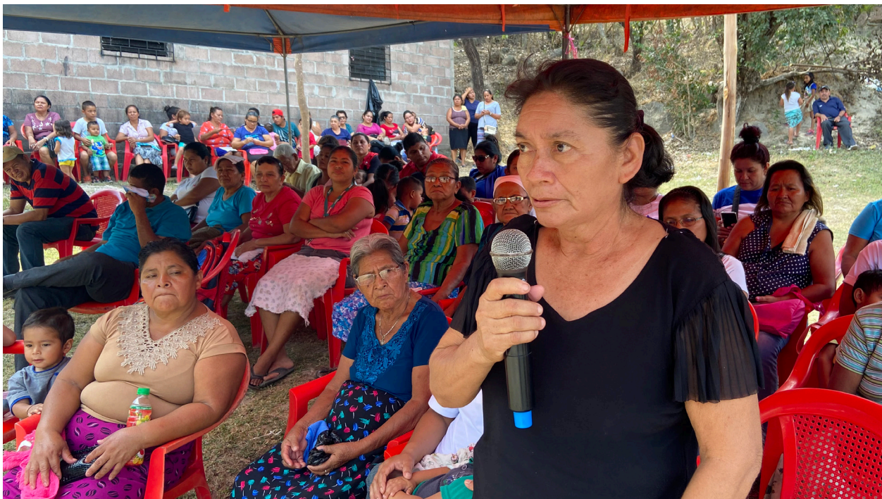
Leaders from the La Ponderosa subdivision in El Salvador organizing to win titles to their land and bring clean water, paved roads and other infrastructure to their community.

committed to the strategy, data on U.S. work visas and economic sanctions in the region, and a review of 26 statements from the Biden administration on migration and development in the region. We cover four main topics: Democracy and Rule of Law, Sustainable Locally-Led Development, Inclusive Economic Policy, and Humane Migration Policy. Cutting across each of these areas, we focus on the degree to which U.S. policy responds to the input of civil society actors and addresses the underlying causes of forced migration, including climate change.